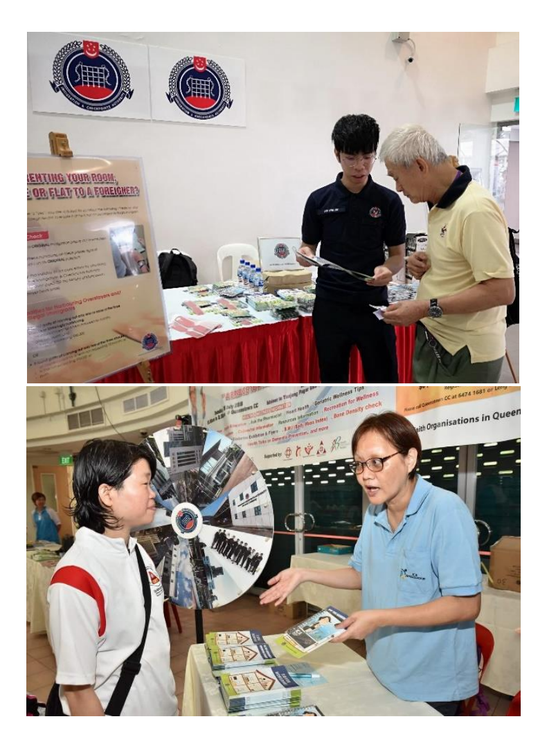
An ICA officer ( Top ) and Ambassador ( Bottom, woman in blue ) engage members of the public on anti-harbouring messages.