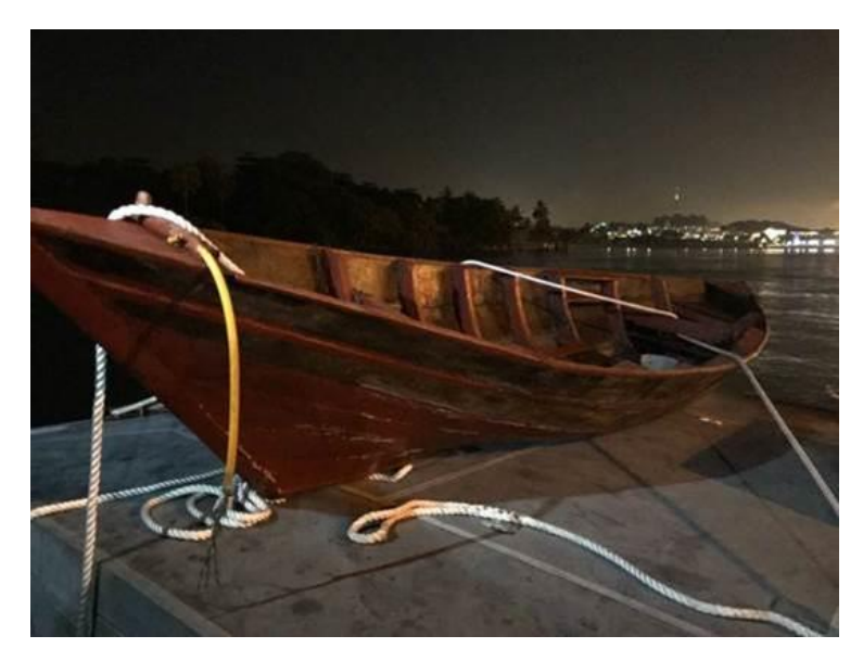
Wooden sampan used by the two men.

The two men were each sentenced to six weeks' imprisonment and four strokes of the cane. The seized sampan was forfeited.