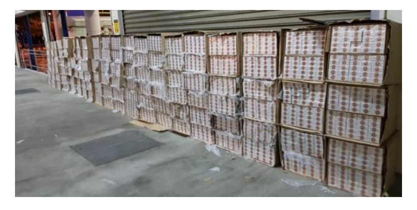
6,000 cartons of duty-unpaid cigarettes were uncovered.