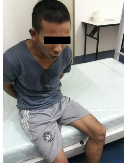
The two men who were arrested and sentenced for unlawful entry into Singapore.