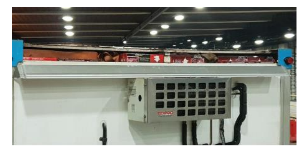
Cartons of duty-unpaid cigarettes were concealed between the roof panels of the lorry.

ICA officers at Woodlands Checkpoint noticed something suspicious in the scanned images of a Malaysia-registered lorry carrying empty plastic cases on 22 September 2018. Further checks uncovered 800 cartons of duty-unpaid cigarettes concealed between the roof panels of the lorry.