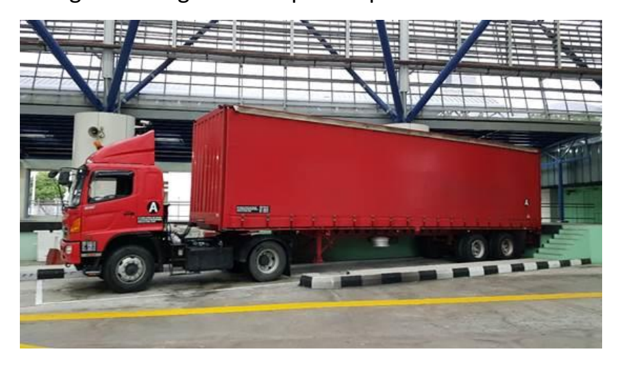
The Malaysia-registered prime mover used to smuggle the duty-unpaid cigarettes.

On 18 May 2018, ICA officers at Tuas Checkpoint detected anomalies in the scanned images of a consignment carried by a Malaysia-registered prime mover, and subjected the prime mover to more detailed checks. During the checks, ICA officers discovered 6,000 cartons of duty-unpaid cigarettes concealed amongst a consignment of printer parts and roller scanners.