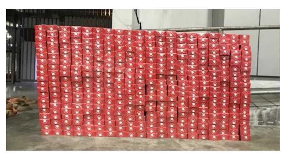
A total of 800 cartons of duty-unpaid cigarettes were retrieved from the Malaysia-registered lorry.