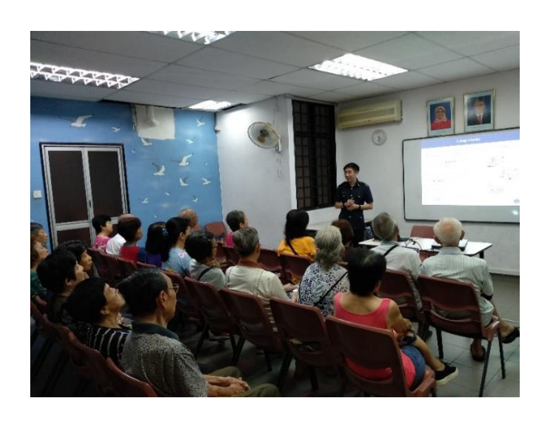
An ICA officer reaching out to residents at Eunos Residents' Committee on anti-harbouring messages.