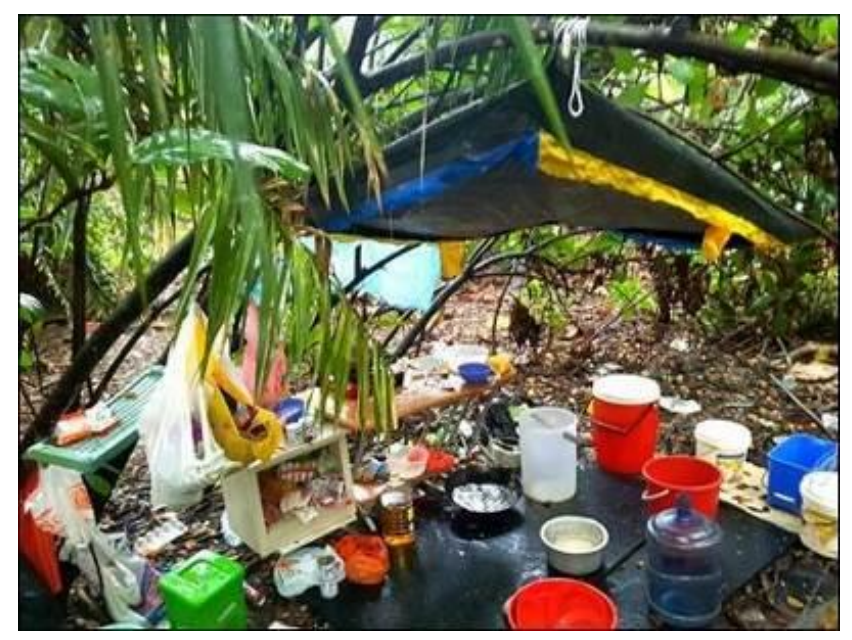
Makeshift shelter in the industrial estate.