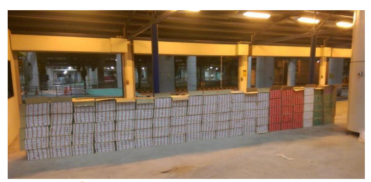
Contraband cigarettes uncovered

On 8 October 2014, ICA officers stopped a Malaysia-registered lorry for routine checks upon arrival at the Tuas Checkpoint. The lorry was declared transporting be of consignments garment and thermal paper. Officers conducted a thorough search and uncovered 5,000 cartons of contraband cigarettes.