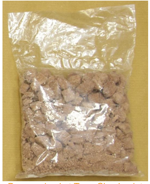
Drugs seized at Tuas Checkpoint