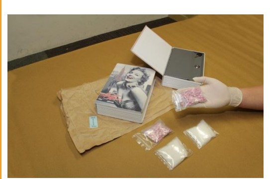
Drugs found in hollowed book