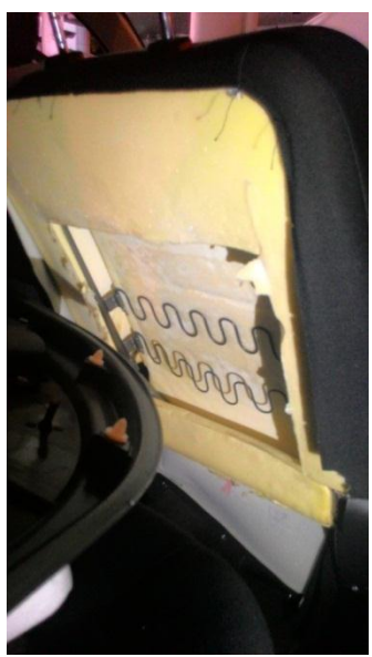
Drugs seized at back portion of driver's seat at Woodlands Checkpoint

On 18 December 2014, more than 5kg of cannabis and 400g of heroin were seized at the Woodlands and Tuas Checkpoints respectively from two Malaysia-registered cars. The seized drugs had an estimated street value of more than S$227,000.