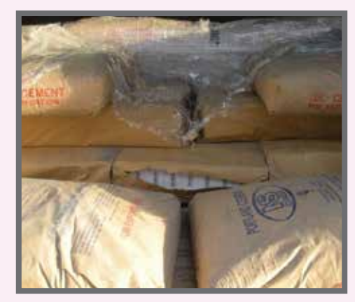
Location: Arrival Cargo Bay