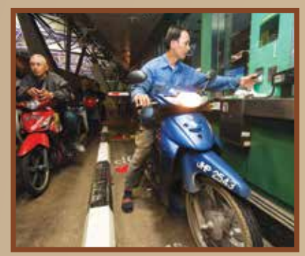
Biometrics Identification of MotorBikers System (BIKES)