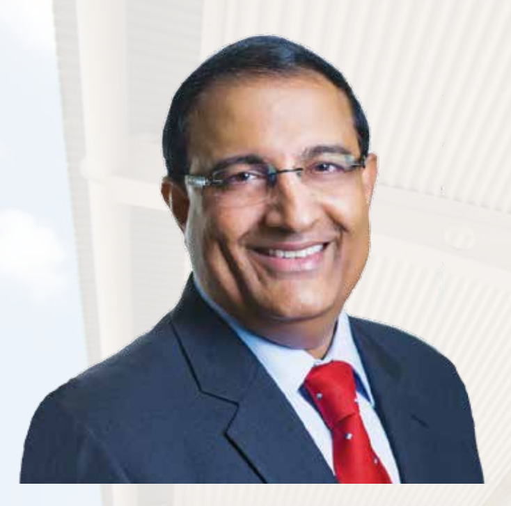
MR S ISWARAN Minister in Prime Minister's Office, Second Minister for Home Affairs, Second Minister for Trade and Industry

Singapore's economic success over the years has been built on our safe and secure environment. ICA's role in securing an efficient flow of people, goods and services has contributed significantly to this. Over the past decade, ICA has leveraged on technology to address the evolving needs of diverse checkpoint users. ICA's readiness to reinvent the way work is performed, and its openness to identify synergies and explore how technology can be used, are highly commendable. ICA's implementation of its "Flex-i" immigration hall to better address travellers' movements at our newly-opened Marina Bay Cruise Centre Singapore, is an example of how ICA continues to keep pace with increasing expectations using technology as an enabler.