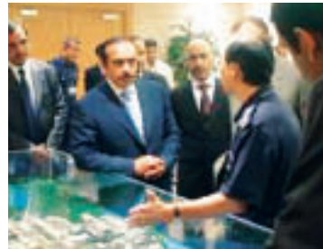
Commander Woodlands briefing H.E. Lt. Gen. Shaikh Rashed Bin Abdulla Al Khalifa and his delegates on ICA's checkpoint operations.

Visit by Minister of the Interior, Kingdom of Bahrain.