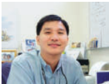
MINISTRY OF MANPOWER

“The relationship between MOM and ICA has been very cordial. We’ve been assisting each other in our operations even