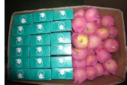
Interesting hideouts include (clockwise from top left) floorboard beneath oil drums, consignments of salt & fruits and even vessel manhole!