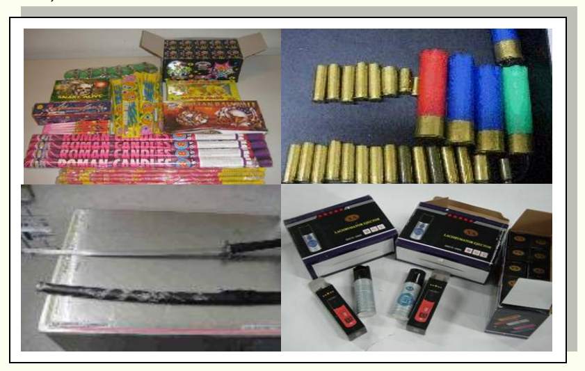
Common security-related items seized (clockwise from top left): fire works, empty bullet cartridges, pepper sprays & samurai swords

As with 2009, the Airport remains the checkpoint that detected the most number of cases of security-related items brought in by travellers. In 2010, the number of cases involving security-related items referred to the Police climbed by 41 per cent from 6,900 cases in 2009 to 9,700 in 2010.